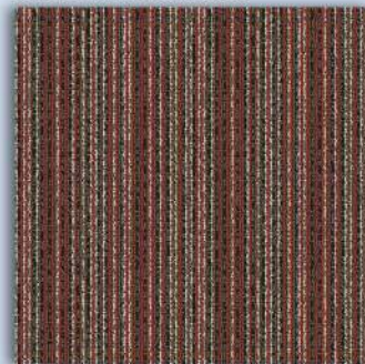
AS 626 RED STALLON