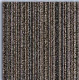
AS 625 MINERAL HAZE