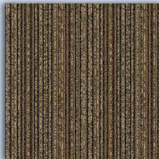
AS 622 TWISTED GOLD

Accent collection pairs classic stripes with nature texture and aesthetics. The Accent collection is versatile and fits into a variety of spaces: offices, multi-family, educational spaces and more.