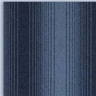
D6 474 NILE BLUE

Depth collection is inspired by forest mystism and energy. The energy that can be felt all around us, flowing through natural forces and circulated to us in abundance.