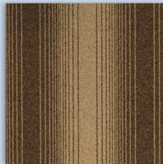
D6 477 HERSHY BROWN