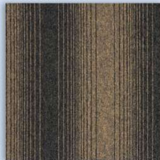
D6 479 BROWNIES GRAY